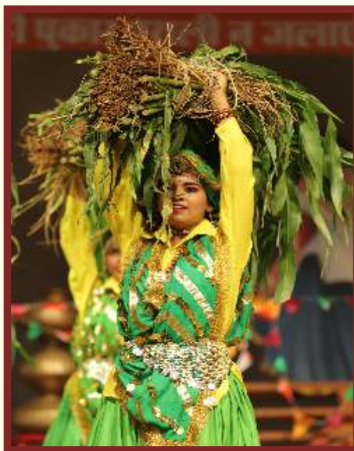
Folk Costume Male & Female Haryana