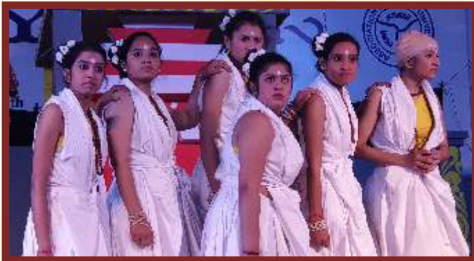
One Act Play North Zone Inter University Youth Festival Punjab University, Chandigarh 2019