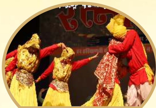
FOLK TRIBAL DANCE