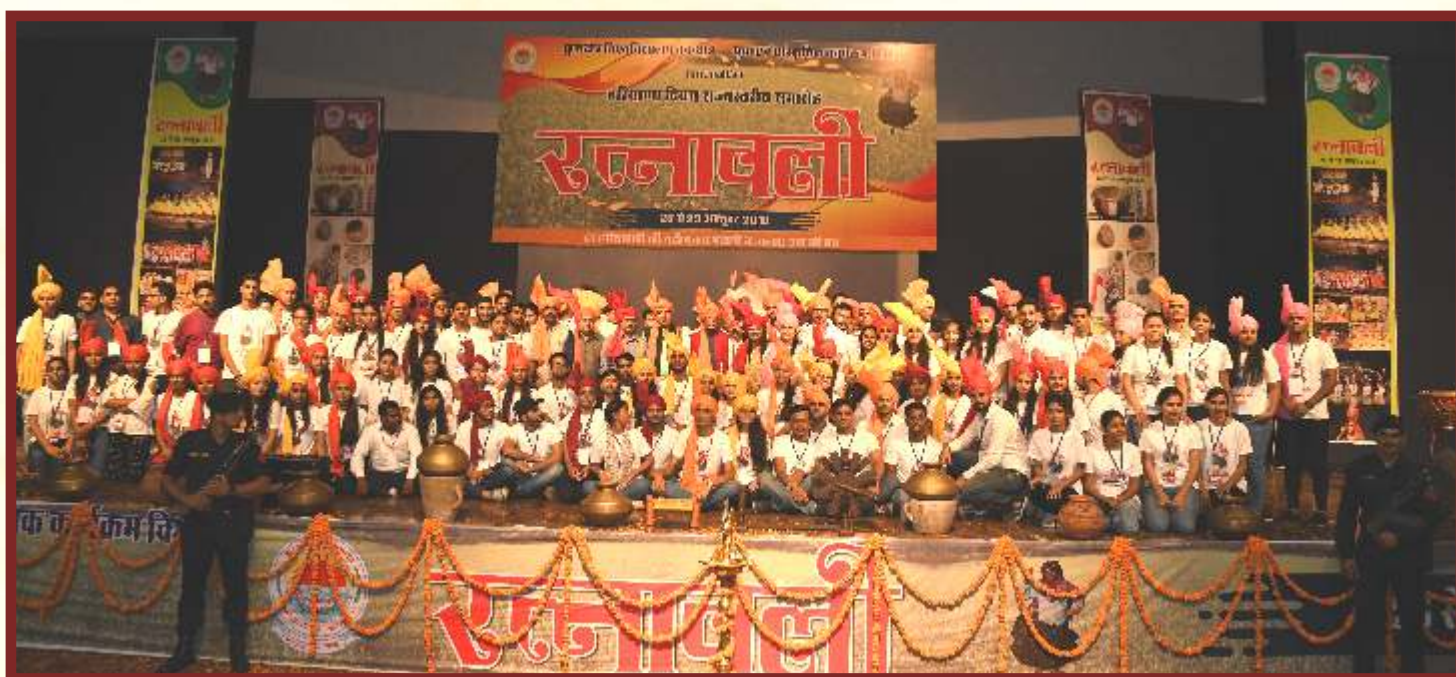
Volunteer of "RATNAWALI" Haryana Day State Level Festival, Kurushetra University, Kurukshetra 2019