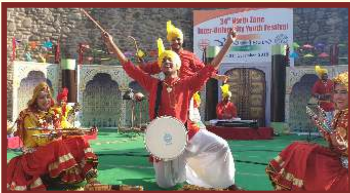
Folk Orchestra North Zone Inter University Youth Festival Punjab University, Chandigarh 2019