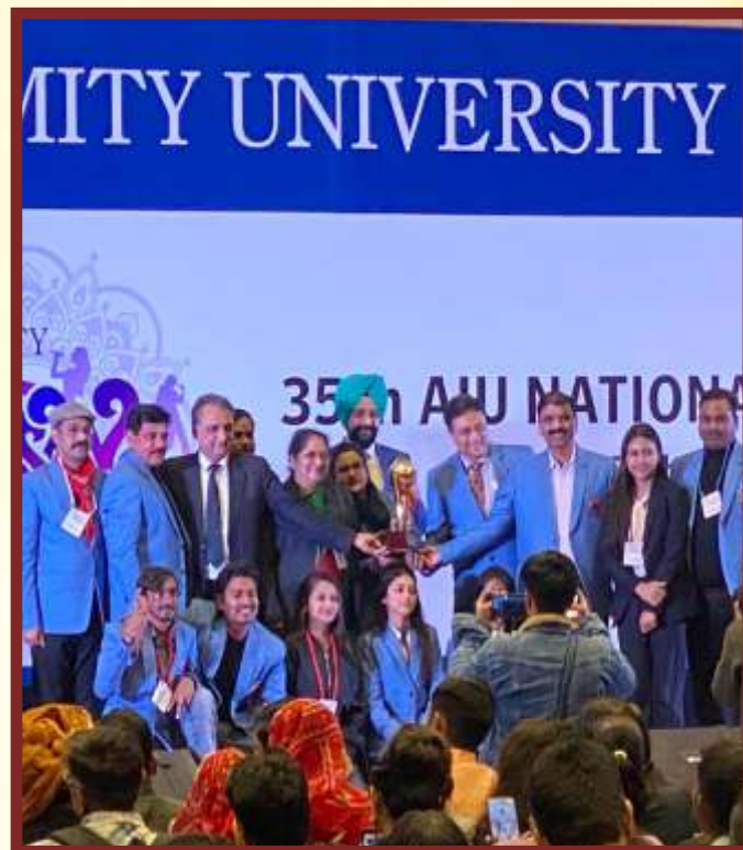
Gold Medal in Group Song Indian in All Indian Inter University National Youth Festival 2020