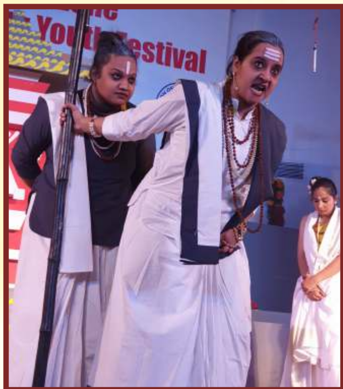
One Act Play All Indian Inter University National Youth Festival CU Chandigarh 2019