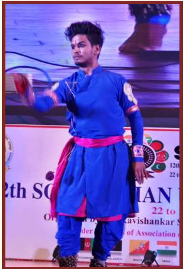
Classical Dance 12th SAUFEST-2019 Pt Ravishankar Shukla University, Raipur