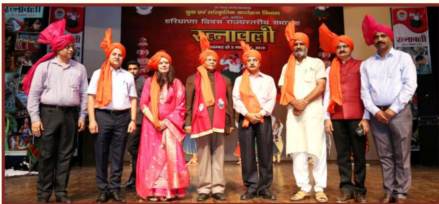
Chief Guest of inaugural of "RATNAWALI" 2019