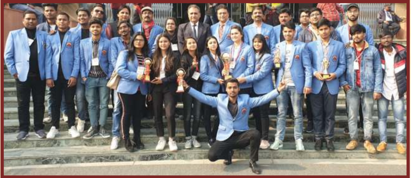
All India Inter University National Youth Festival AMITY University, Noida 2020