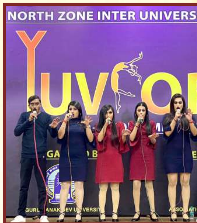
Western Group Song in North Zone and All India National Youth Festival Winner 2020